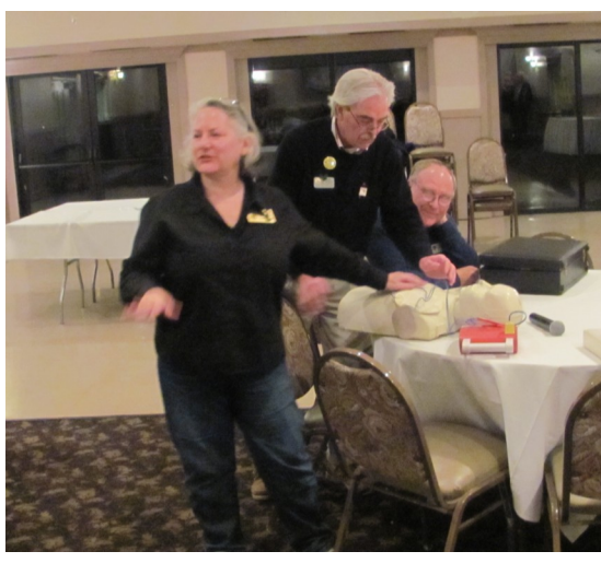
LION NEWS Page 3