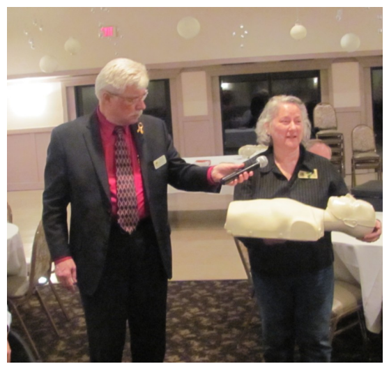
Teaching us a little about CPR and using the AED